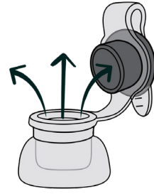
Fast Deflation Valves fully open to deflate in seconds

Do not OVER INFLATE. It is suggested to inflate about 80%-90% full especially on hot days.