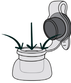
Fast Inflation Valves fully open to inflate