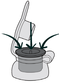
Inflate by Pump The middle valve stops the air coming out