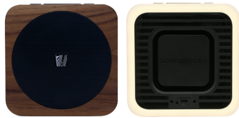
SoundSpot II TA-18H-WB - Wood/Black