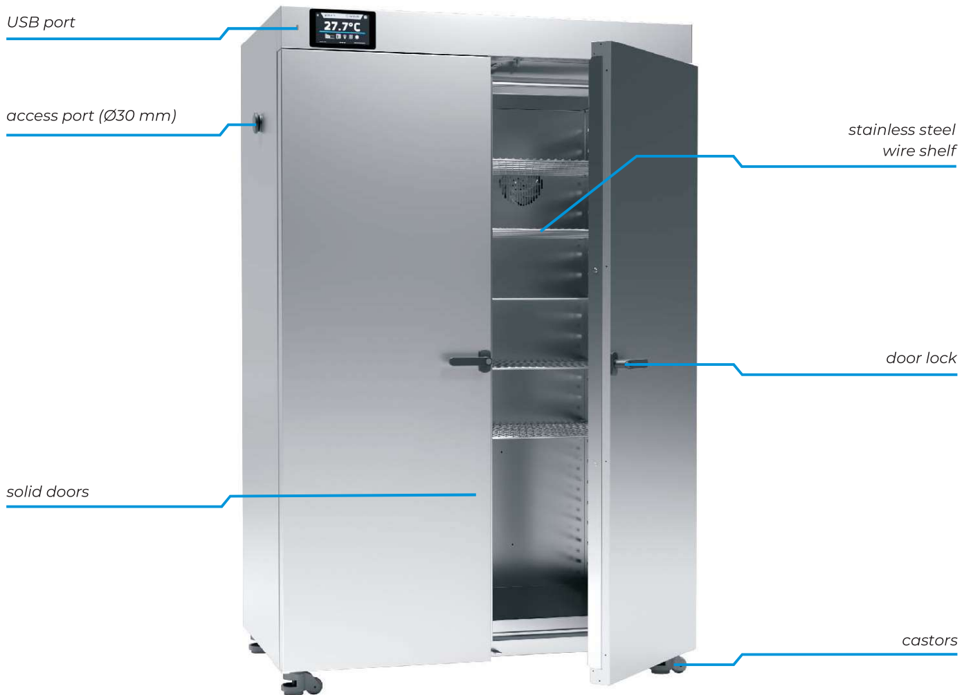
Drying oven SLW 1000 IG Smart PRO

Drying ovens are designed to provide high temperatures up to 300°C