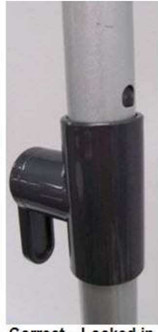
Correct - Locked in