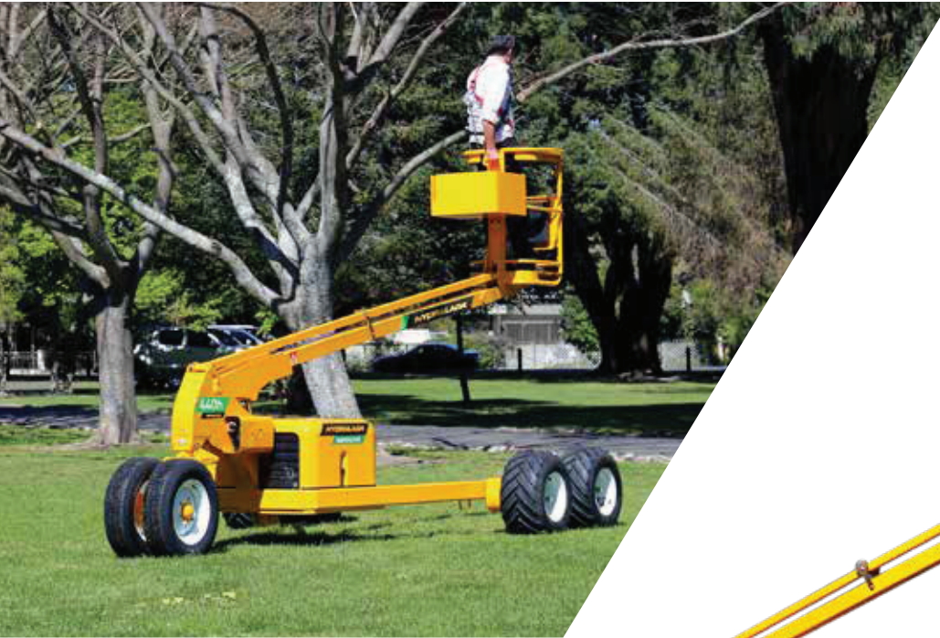
Image shows Dual Castor and Tandem Four Wheel Drive Options.