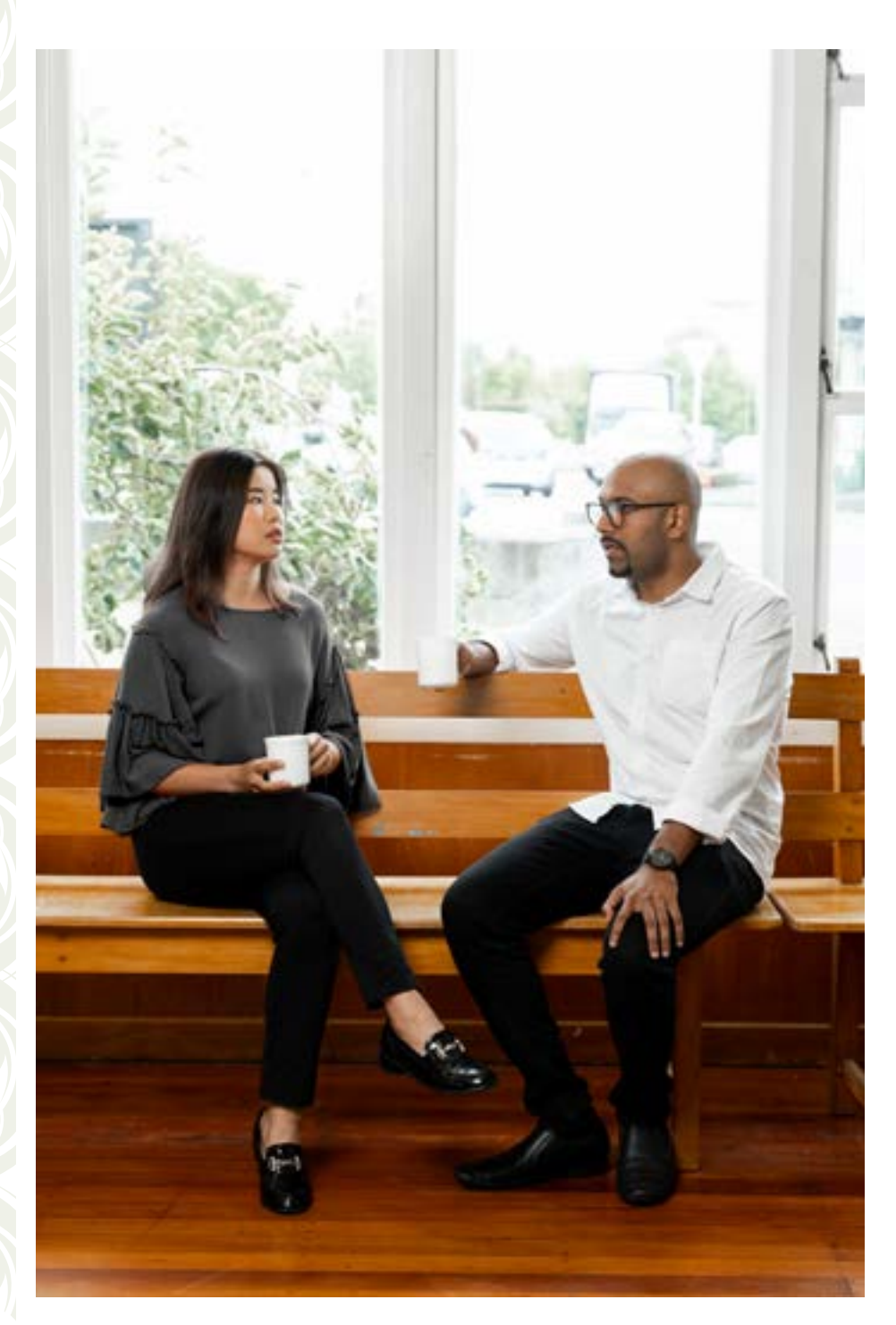
Funerals in Aotearoa after a death by suicide