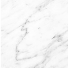
White Carrara White marble