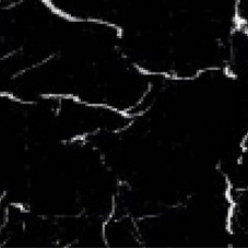
Nero Marquina Black marble