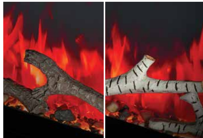
OPTIONAL: Driftwood Logs, Birch Logs