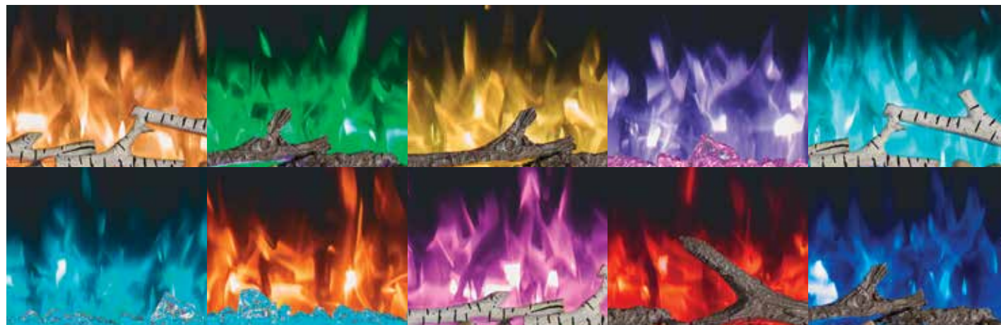
10 flame color options and 10 ember bed color options with cycle mode