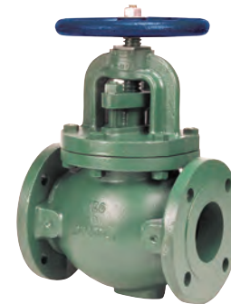
F-738-31 Flanged-Raised Face

WARNING: This product can expose you to chemicals including lead, which is known to the State of California to cause cancer and birth defects or other reproductive harm. For more information go to www.P65Warnings.ca.gov .