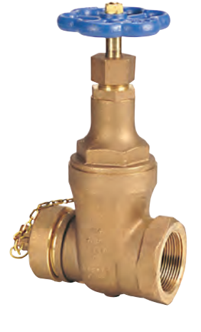
T-103-HC Threaded w/Cap and Chain