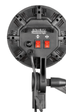
Daylite4 MKIII Head