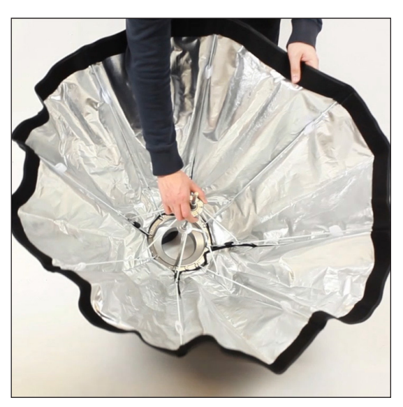
First, find an open area, and place the umbrella softbox on the floor silver-side up.