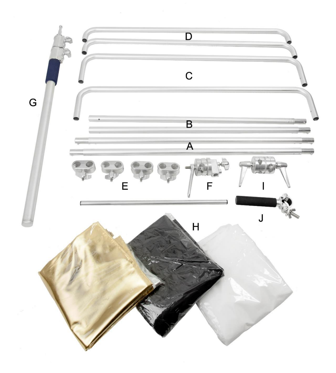
List of Included Parts