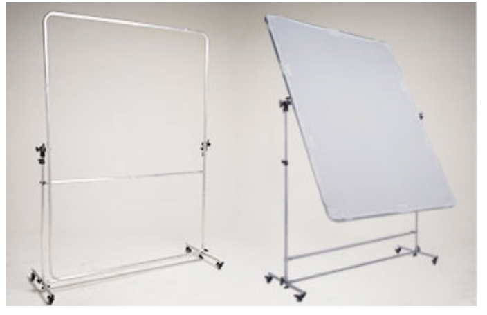
8: Now Install the previously assembed scrim frame to the "C" rods, using the "G" brackets and a the assembly of the frame is complete.