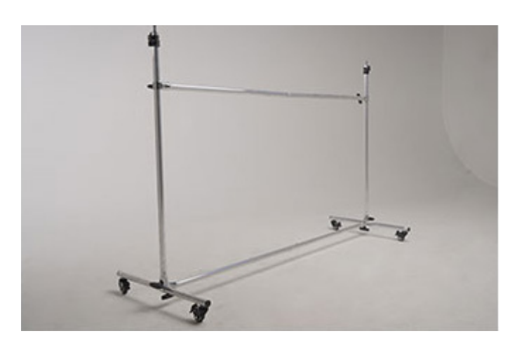
7: Install the two rods labbled "C" to the "F" connectors on ech side as show, then use the remaining "D" rod to connect the two "C" rods at the top as shown.