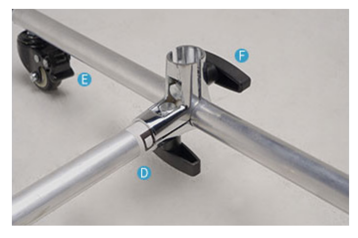
5: Take the connectors labelled "F" to connect one of the "D" rods, and the wheeled "E" rods together as shown.