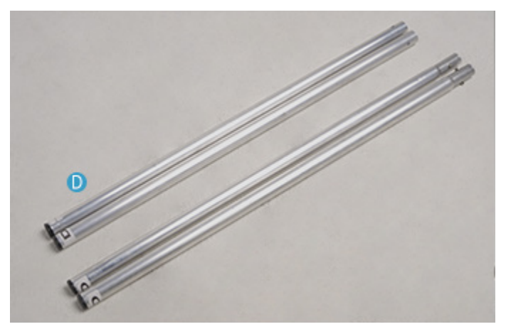
3: Find the four poles labelld "D" and set them on the ground as shown.