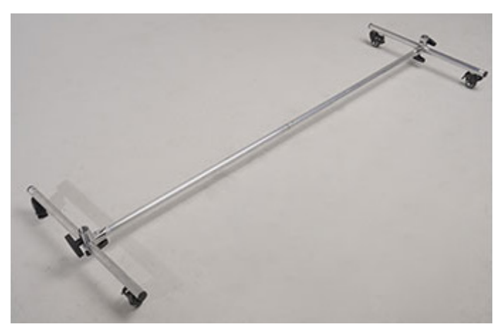
6: Install the Wheeled "E" rods on both sides as shown in the image above.