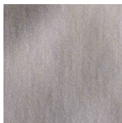
BARLEY ALPAGA VELVET