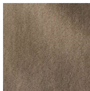
VANILLA ALMOND ALPAGA VELVET