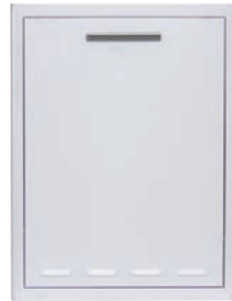
18-Inch Single Trash/Propane Drawer

Available as single trash/propane storage drawer, double trash/recycle drawer, and narrow single trash drawer models.