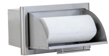
Paper Towel Holder