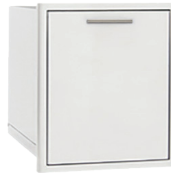
Double Trash/Recycle Drawer