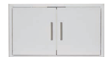
Dry Storage Cabinet