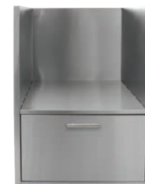
Kamado Island Sleeve with Drawer