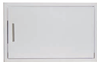
Single Access Horizontal Doors