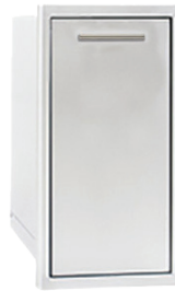
Narrow Trash Drawer