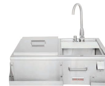
Blaze Beverage Center

Allows you to build your kamado into an outdoor kitchen for a finished look.