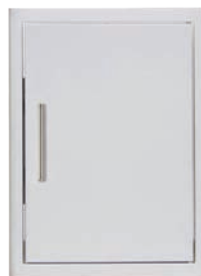
Single Access Vertical Doors

All Blaze cabinetry is produced in the USA and comes standard with soft close doors and drawers equipped with automatic on/off LED lights.