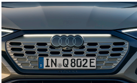
Singleframe projection light