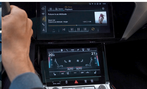
MMI navigation plus with MMI touch response