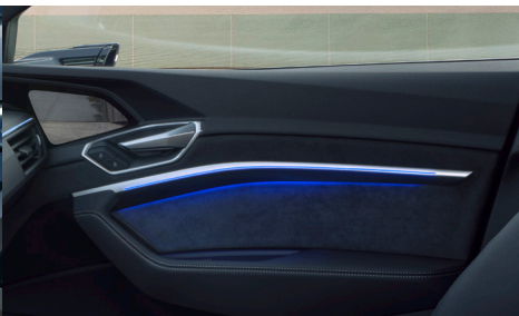
Ambient lighting package plus