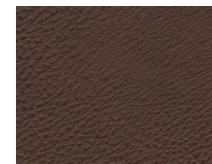
Weston Fudge (PR1)

Weston Fudge: CL-8080-REC-P-PR1 Weston Truffle: CL-8080-REC-P-PR2 W37.5 D41.5 H42