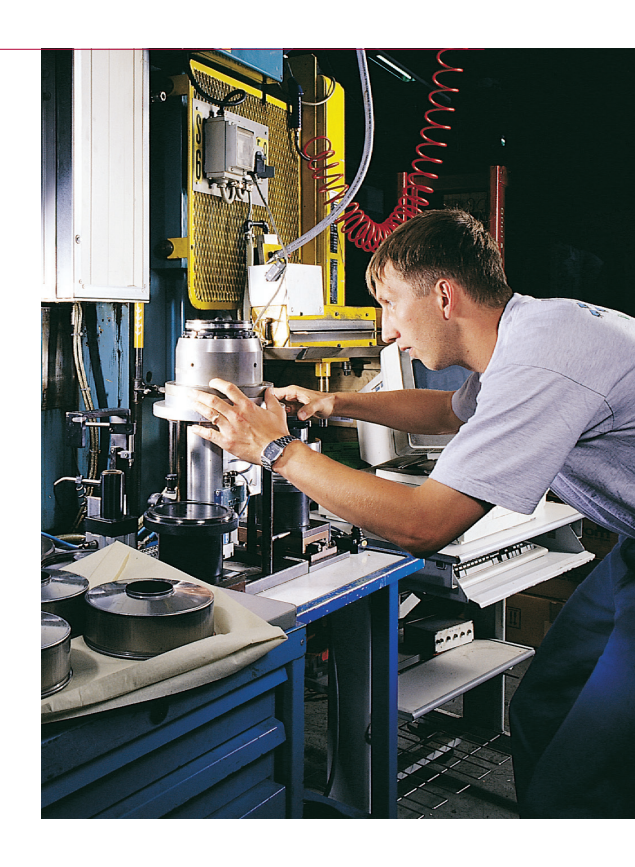
* Extra delivery time may be required.