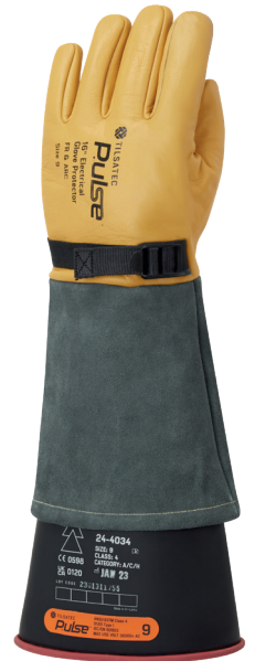
29-7456 16"/40 cm