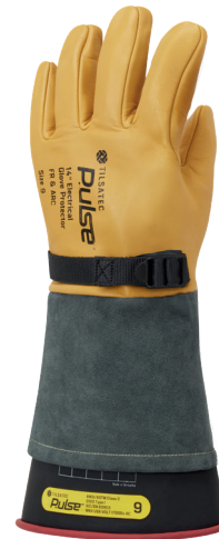
29-7454 14"/35 cm