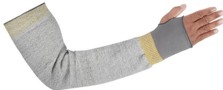
81-6121/CK - elasticated top to keep sleeve up

Delivering level A7 cut resistance to ANSI/ISEA 105 it is designed for component handling, metal pressing, and handling sheet materials with sharp edges.