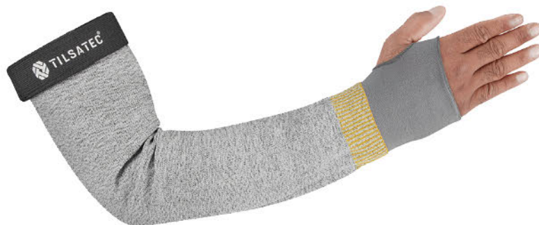
81-6121/CV - hook and loop adjustable strap