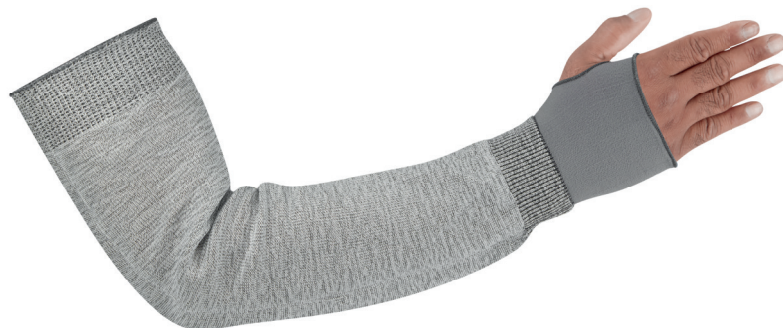
81-4121/CK - elasticated top to keep sleeve up

Delivering level A4 cut resistance to ANSI/ISEA 105 it is designed for component handling, metal pressing, and handling sheet materials with sharp edges.