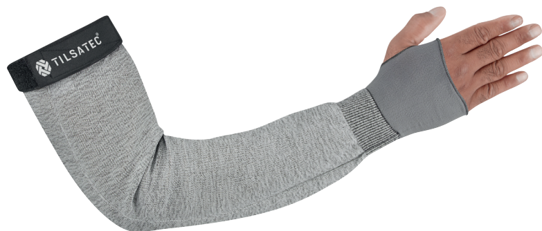
81-4121/CV - hook and loop adjustable strap