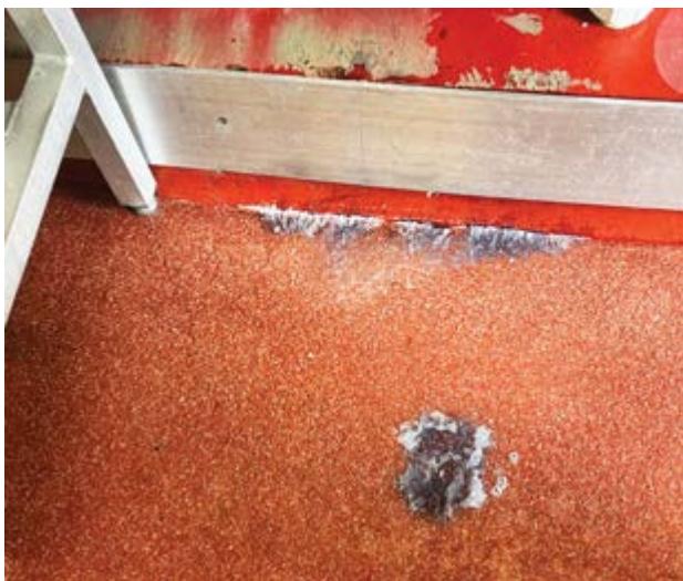
Indicon® Gel was used to rapidly identify biofilm bacteria in locations around the plant.

Biofilms, complex structures formed by microorganisms, pose a significant concern as they harbour harmful bacteria and compromise the quality and safety of food products. Traditional hygiene methods, including chlorine foam and terminal sanitisers, proved effective but lacked the specialised biofilm-targeting capabilities offered by ProvaCharge Foam.