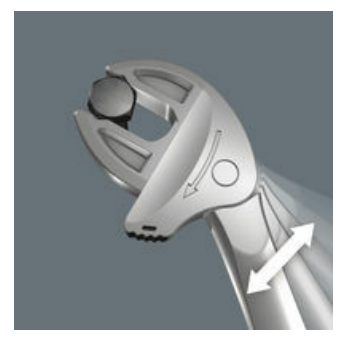
The ratchet function in the mouth sees to fast and consistent screwdriving without removing the tool.