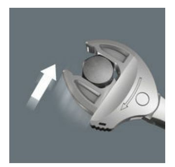
With its automatically and continuously gripping parallel jaws the Joker spanner 6004 covers all dimensions in the respective field of application. The tool automatically finds the required size when placed on the bolt or screw, no setting required.