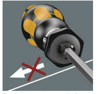
The hexagonal non-roll feature prevents any rolling away at the workplace.