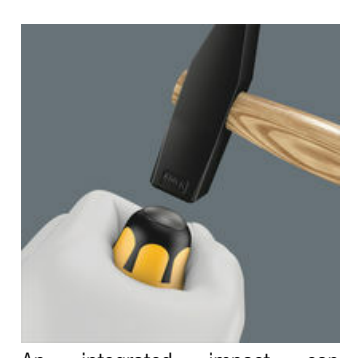
An integrated impact cap lengthens the service life and reduces the danger of splintering. Nevertheless, always wear protective goggles.