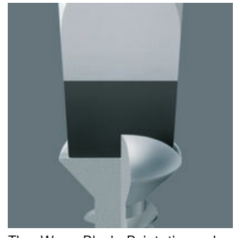
The Wera Black Point tip and a refined hardening process ensure long service life of the tip, improved corrosion protection and an exact fit.