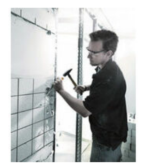
Screwdrivers are often misused as chisels. This can be dangerous. The chiseldriver is the solution when not only screwdriving is required. For fastening, chiselling and loosening seized screws. Wera chiseldriver: the screwdriver whenever the going gets tough!