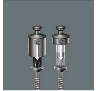
Reduced contact pressure

Wera Lasertip reduces the contact pressure required and enhances force transfer - meaning less screwdriving effort is required. Screwdriving becomes safer and easier.