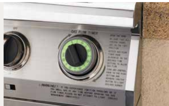
Built-in mechanical PGS FuelStop® one-hour gas flow timer and control panel featuring laser-etched operating instructions