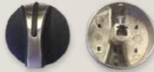
Anti-Theft control knobs are standard on all Legacy T-Series models