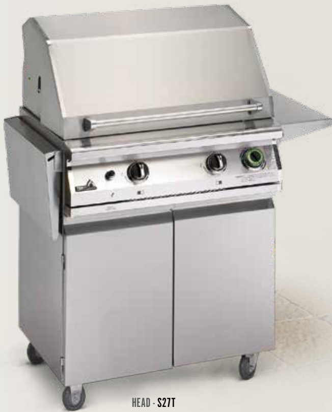
HEAD - S27T CART - S27CART