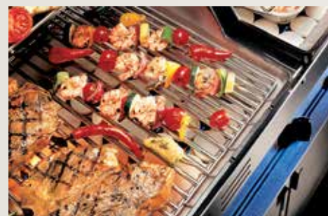
Our Performance Grilling System is an industry exclusive