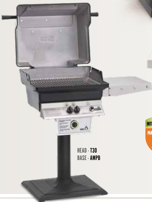
HEAD - T30 BASE - AMPB