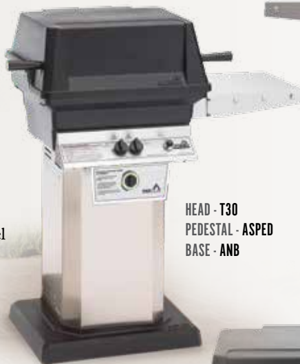
HEAD - T30 PEDESTAL - ASPED BASE - ANB

T30 Our T30 all aluminum grill head combines the PGS FuelStop ® one-hour gas flow timer, twin 15,000 BTU burners, 330 square inches of commercial grade stainless cooking grids, electronic (AA battery powered) ignition, and a wide variety of mounting options (the same options for mounting as the T40). The T30 comes standard with one stainless steel folding side shelf.