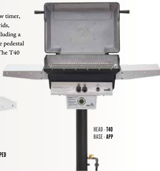
HEAD - T40 BASE - APP