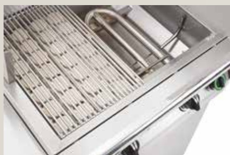
Cooking grid, ceramic briquettes, burner system and back-up lighting port interior of PGS Newport S27T.