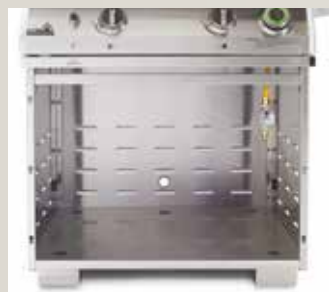
Pedestal Interior. Four entry points allow for easy gas connection hook-up.