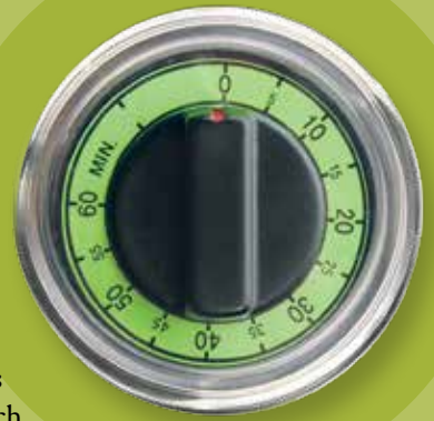
PGS FuelStop® one-hour gas flow timer

Combine this great energy saving feature with our commitment to producing high efficiency burner systems, our use of materials that quickly deliver heat to the cooking grids, and the result is the ULTIMATE "green" Performance Grilling System! PGS grill materials are chosen to last, which keeps our grills on your patios and common areas - and not in a landfill.