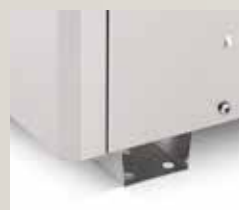
Standard feet comply with ADA indoor height requirements.