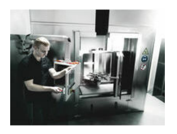
The individual testing at 10,000 volts, in accordance with IEC 60900, ensures safe working with loads up to 1,000 volts.