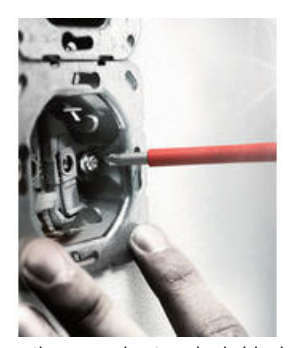
For the use in terminal blocks, control cabinets, switches, relays, sockets etc.

Our screwdrivers are tested for dielectric strength under a 10,000 volt load to make sure that their most important property, their insulation, has been exhaustively tested. Each individual Wera VDE screwdriver is subjected to this test to guarantee safe working up to 1,000 volts.