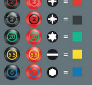
Screwdrivers with "Take it easy" tool finder: colour coding according to profile and size stamp.