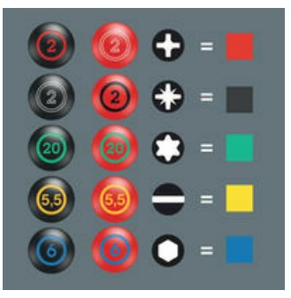
Screwdrivers with "Take it easy" tool finder: colour coding according to profile and size stamp.