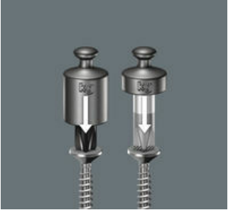
Wera Lasertip reduces the contact pressure required and enhances force transfer - meaning less screwdriving effort is required. Screwdriving becomes safer and easier.