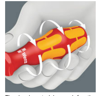
The hard materials used for the handle ensure rapid hand repositioning without any danger of the skin "sticking" to the handle. The surrounding hard zones with large diameters glide like wheels through the hand.