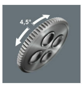
The integrated ratchet with fine toothing (80 teeth) and a return angle of 4.5^{\circ} eases and accelerates screwdriving without having to reposition the tool.