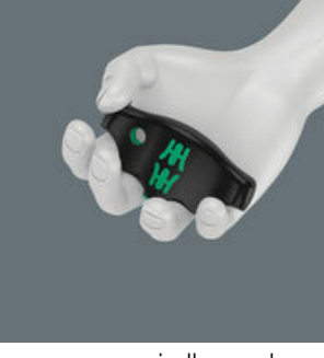
Ergonomic 2-component Thandle

The ergonomically shaped 2-component T-handle with finger recesses and pleasant surface facilitates very high power transmission and fatigue-free working.