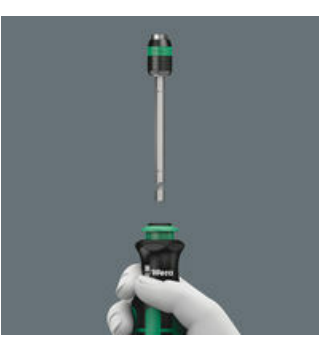
If the clamping sleeve is pushed again the telescopic blade can be taken out of the handle, and be used as a machine bit adaptor.