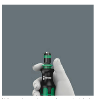
When the unique telescopic blade is lowered into the handle, fast, easy screw-driving action is possible, even in the tightest spots!