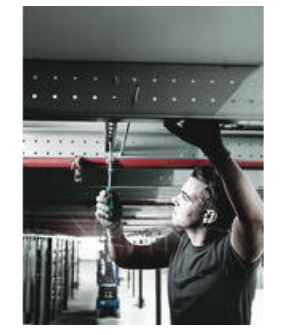
Why is the right tool so often not at hand? The reason: too many tools and overly-heavy tool bags can make it bothersome to carry them onsite. So for us it was a clear challenge: to design a tool that is suitable for a whole host of applications and can be easily taken along to jobs at other sites. Our solution: Kraftform Kompakt tools. A handle into which blades with a range of different profiles can be inserted. Compactly and protectively housed in a light and robust textile pouch or plastic box.

Telescopic blade, integrated bit magazine, Rapidaptor technology