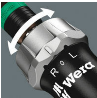
Changing ratchet direction

Ergonomic design of the reverse direction switch.