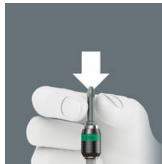
Rapid-in and self-lock

The bit can be pushed into the adaptor without moving the sleeve. The lock is activated automatically as soon as the bit is applied to the screw. Bits are held securely and wobble-free.