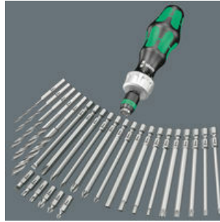
Handle/interchangeable blade system

The handle/interchangeable blade system allows rapid exchange of the blades required for a wide range of applications.