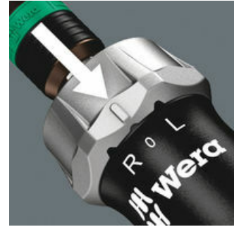
Fine adjustment work

Additionally, the lockable neutral position permits exact adjustment work without having to change the screwdriving direction every time. Lockable neutral position for fine adjustment work.