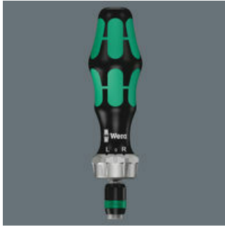
816 RA Ratchet screwdriver

Ratchet screwdriver, fine-tooth design for minimal return angle, switchover ring (right, locked, left), maximum torque of up to 50 Newton metres, 1/4" hexagon chuck with Rapidaptor technology i.e. rapid-in, rapid-out, rapid-spin, chuck-all and single-hand function for rapid bit change, magnetic, suitable for hexagon socket insert bits as per DIN ISO 1173-C 6.3 and E 6.3 and Wera series 1 and 4