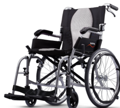
Ergo Lite 2 with self propel, quick release rear wheels.

Swing in and out detachable footrests add convenience when the user transfers in tight spaces.