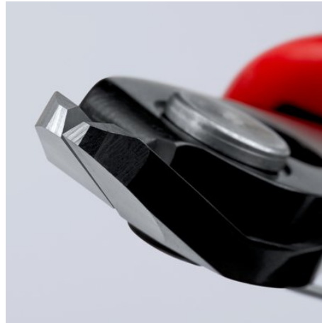
Shear cut with controlled micro cutting edge misalignment for the most precise cutting of even the thinnest of wires and for a long service life