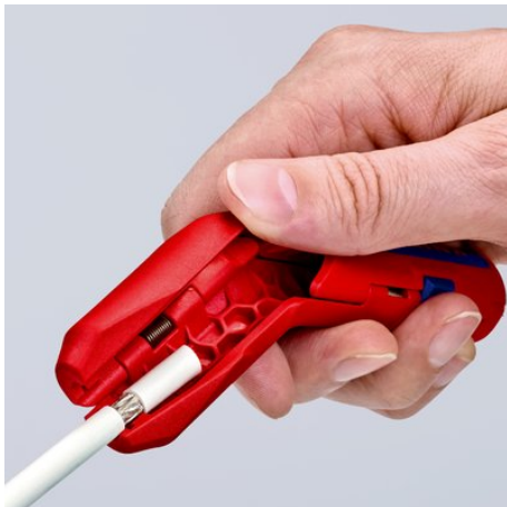
stripping of a coax cable