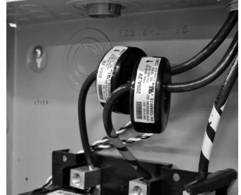
Fig. 1. Typical Solid Core Sensor Assembly.