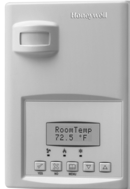
TB7600 Series Thermostat with Occupancy Sensor