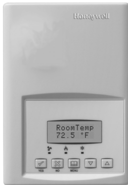
TB7600 Series Thermostat