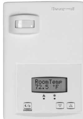
TB7200 Series Thermostat with Occupancy Sensor