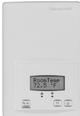
TB7200 Series Thermostat