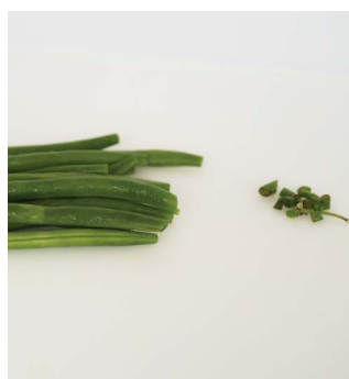
Slice the tops off.