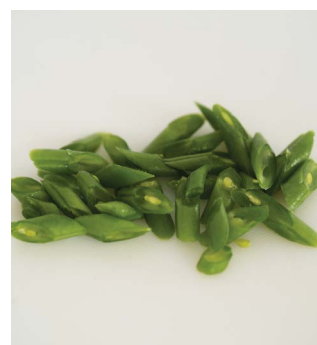
Cut diagonally into bite-sized pieces.