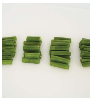
Slice across the bean into bite-sized pieces.