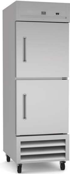
738285 (KCHRI27R2HDF) 2-half door reach-in freezer, stainless steel, 23 cubic feet, R290 refrigerant gas, -9°F - Energy star