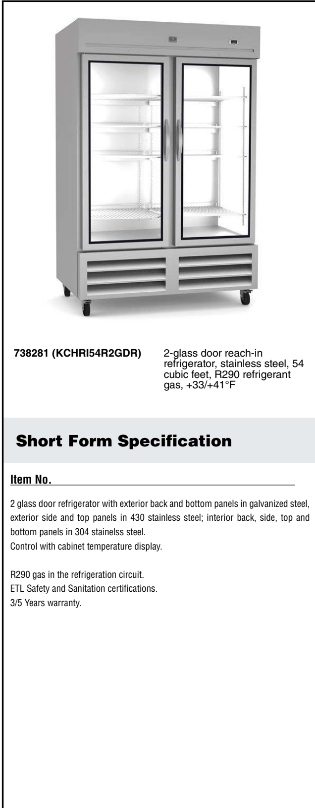
738281 (KCHRI54R2GDR) 2-glass door reach-in refrigerator, stainless steel, 54 cubic feet, R290 refrigerant gas, +33/+41°F