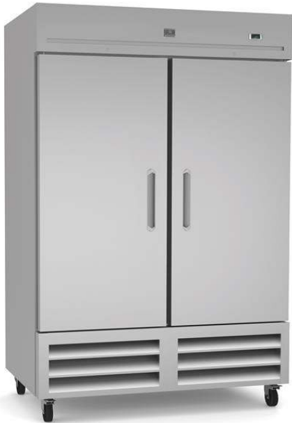
738242 (KCHRI54R2DRE) 2-door reach-in refrigerator, stainless steel, 49 cubic feet, R290 refrigerant gas, +33/+41°F - Energy Star