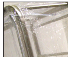
Nylon Rack Cover