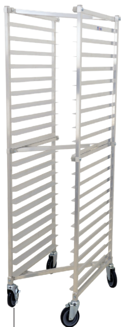
Item 43474 Aluminum Nesting Sheet Pan Rack 20 Slides Square Top Knock Down