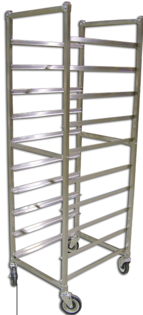
Item 23833 Stainless Steel Pan Rack 10 Slides Square Top Knock Down