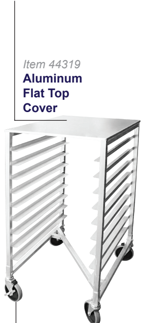
Item 44317 Aluminum Nesting Sheet Pan Rack 9 Slides Square Top Welded