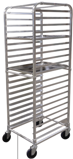
Item 28351 Aluminum Pan Rack 20 Slides Curve Top Welded