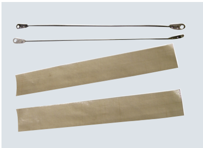
Element Service Kit* (Includes 2 wires and 2 strips)