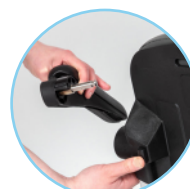
Easy to remove armrests