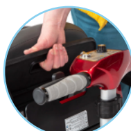
Seat base carry handle