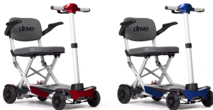
MFLD2RD - Red

**Without armrests, cushions and batteries