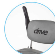
Flip up armrests