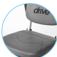
Comfortable and removable padded seat and backrest