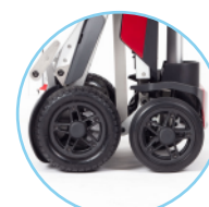
Puncture proof tyres