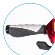
Two tone tactile handgrip