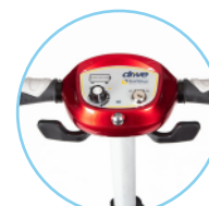
User friendly controls