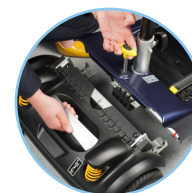
Super easy split mechanism

If you would like to view this product please contact your local stockist.