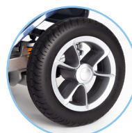
Stylish silver wheel hubs