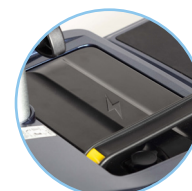
Lightweight lithium batteries