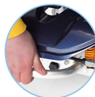
Front impact bar / carry handle