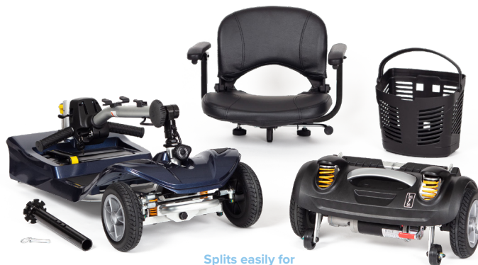
Splits easily for transportation

*Speed and range may vary depending upon user weight, type and incline of terrain, weather, battery charge and condition, operating speed and general driving situation