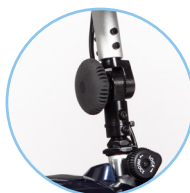
Angle adjustable tiller