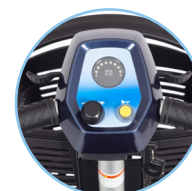
User friendly controls