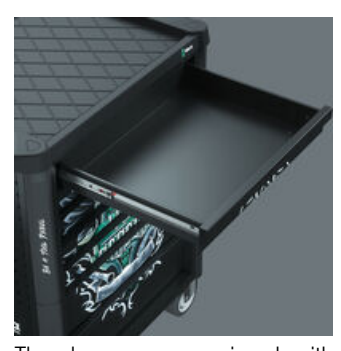
The drawers are equipped with ball bearing telescopic slides and can be pulled out completely. Selfclosing and mutually locking to prevent unintentional opening, thus minimal risk of tilting for roller cabinets. The carefully considered drawer design allows optimal use of the interior space. The dirtresistant drawer coating makes cleaning easy.