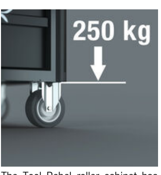
The Tool Rebel roller cabinet has large wheels, each with a load of 250 kg, with precision ball bearings and double ball rims in the spindle carrier. The workshop trolley is easy to move, even under high dynamic loads.

The ergonomically arranged lateral position of the lock improves usability and protects the key and lock from damage. The extremely robust locking system protects the tools stored in the roller cabinet against unauthorized access. The central locking is completed by a cylinder lock. Two folding keys are included.