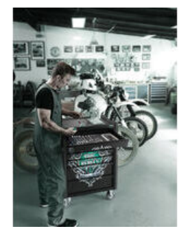
Exclusive roller cabinet in the Tool Rebel design

Robust design for hard work in the workshop