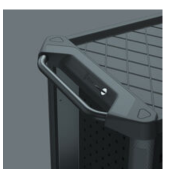
The ergonomically designed handlebar ensures that the roller cabinet is highly manoeuvrable. Durable handle thanks to the black powder-coated metal design.