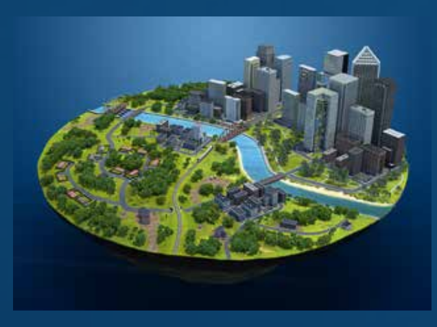
SEG pumps can be used for alternating or continuous operation throughout the water cycle. See examples on watercycle.grundfos.com.