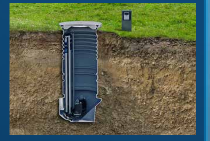
Installation options include submerged installation on auto-coupling with quide rails.