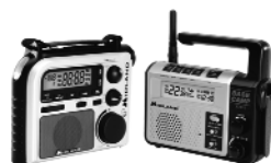
EMERGENCY CRANK RADIOS